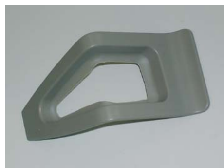
A 2-K injection moulding (TPE + ABS/PC)