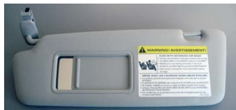
Fig. 1: Vanity mirror frame and slide cover made of Romiloy 6020 (PC/ASA)

It is because of these attractive properties that PC/ASA blends are widely used for internal and external car components – for example, vanity mirror frames and covers (Fig. 1), mountings and