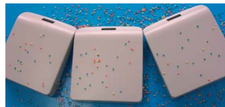
Fig. 3: Spectacles compartment made of permanently antistatic Romiloy EXP 1402 (PC/ASA)

The caps of a spectacles storage compartment made of PC/ASA 1402 (Fig. 3) have high impact resistance and comply with the DIN 53497