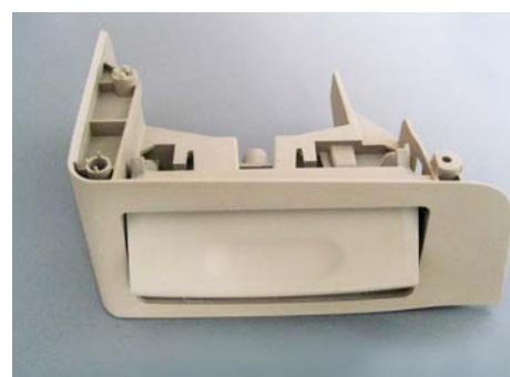
Ashtray with lid