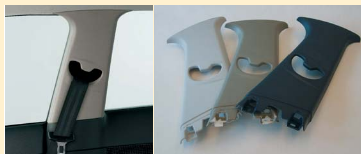
TPU foil with sprayed thermoplastic coating on the underside

ROWA Masterbatch is recommended by Bayer MaterialScience AG as supplier of master batches for aliphatic TPU.