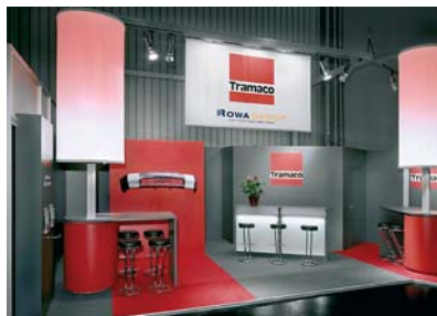
On the Tramaco stand there is a demonstration of the possibilities for finishing furniture surfaces opened up by ROWA Lac's furnishing foils.

Have we whetted your interest? Our flyer listing the products in our new range is fresh off the presses. Ask us to send you a copy. Our ROWA Lacquers team will be glad to answer your detailed questions and give you technical support.