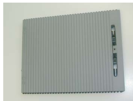
Roller blind made of TPU

Reprint with kind permission of Giesel Verlag. The interview has been published in the K-Zeitung 18/07 on 2007-09-17.