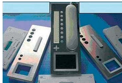
Modern intercom system manufactured by S. Siedle & Söhne of Furtwangen made of translucent white Rotec PC 7017 UV

brand name Rotec PC that is widely used in the electrical, electronic and IT sectors. For example, white and blue translucent Rotec PC 7017 UV is used in high-quality intercom systems. Rotec PC is also used for lamp shades and globes, wall socket frames and DSL box covers. Rotec PC is ideal for these kinds of components which need to be coloured very accurately.