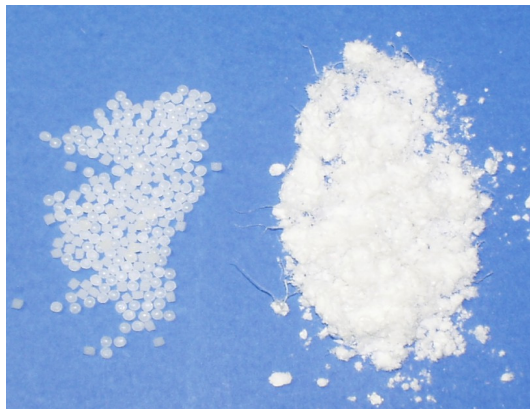
Figure 1. Fines next to Polyolefin Pellets

Fines, fluff, streamers, snake skin, dust and angel hair are all unwelcome occurrences that usually indicate a problem in the pellet transfer system.