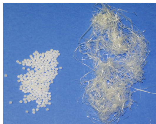
Figure 3. Angel Hair next to PE Pellets

Frictional heat is the major contributing factor to the generation of angel hair and streamers. As polyolefin pellets slide along internal surfaces, high transfer velocities can lead to excessive frictional heat, causing the pellets to melt. The liquefied product instantly freezes to the internal surface wall, forming angel hair or streamers.